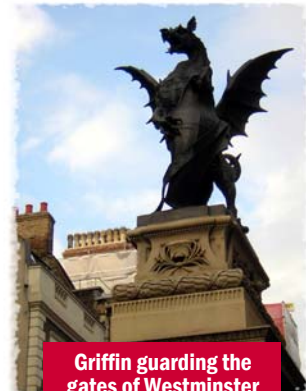
Griffin guarding the gates of Westminster