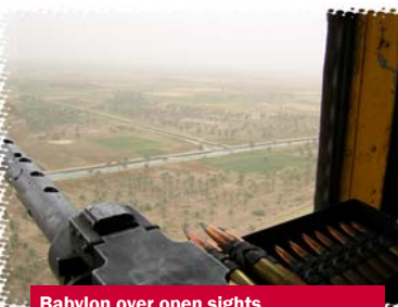
Babylon over open sights