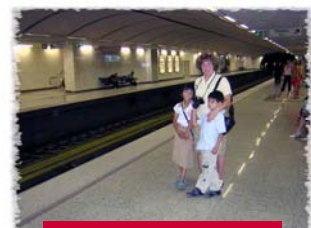
Athens Metro (built by Bechtel)