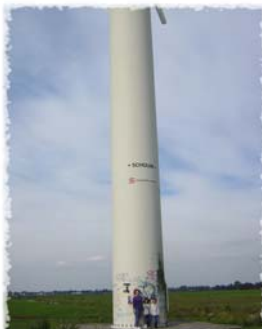
A modern windmill