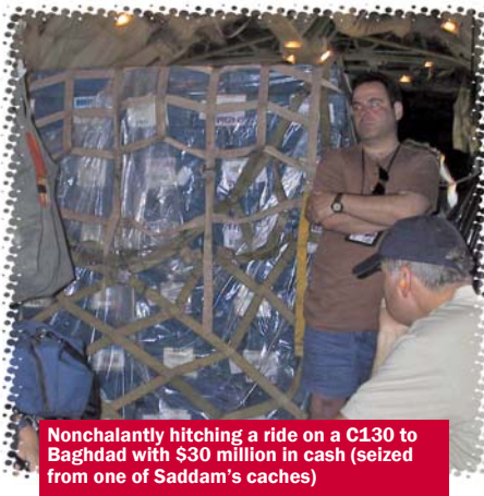
Nonchalantly hitching a ride on a C130 to Baghdad with $30 million in cash (seized from one of Saddam's caches)