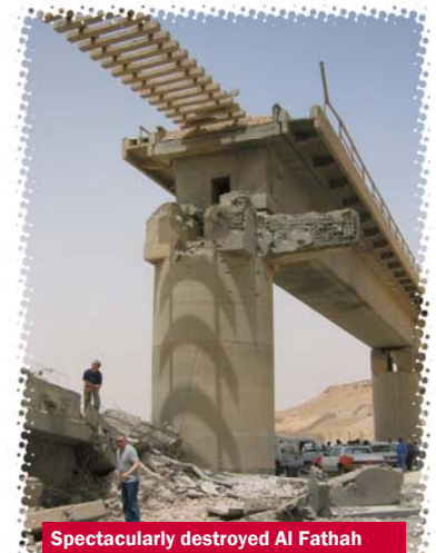
Spectacularly destroyed Al Fathah Railway Bridge