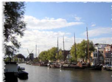
Along the grand canal in Leyden – a scene crying out for someone to paint it

tional Dutch pancakes in a little restaurant you only can find by bike, wandered the back streets of Amsterdam's suburbs, and rode on top of the dikes, noticing how much higher the water was on one side than the land was on the other!