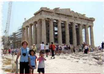
The Parthenon at High Noon