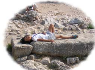
Asleep on a Mycenaean bed?

Next we made a major relocation – by ferry – to Crete, where we installed ourselves in the Miramar Hotel Apartments, with its 3 swimming pools, free breakfast, and location less than 100 yards from the ocean. Special