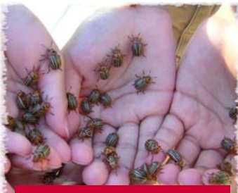
Beetles swarming on Crete