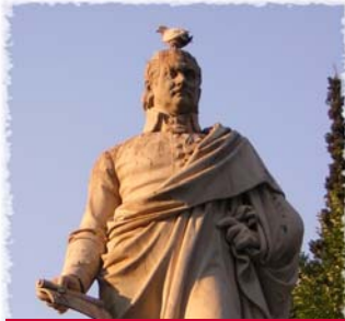
Noble Greek Whatsisname being shown no courtesy by an avian critic