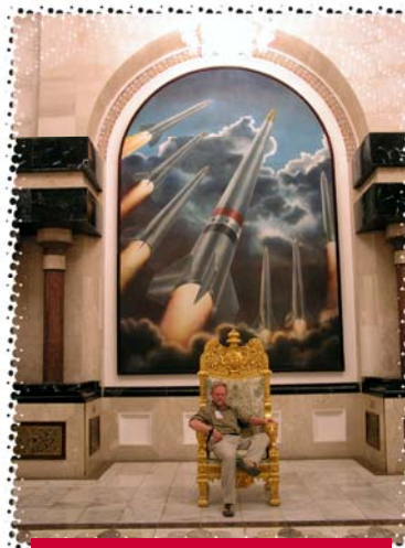
The despot's chair