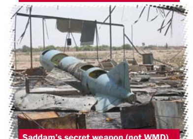
Saddam's secret weapon (not WMD)