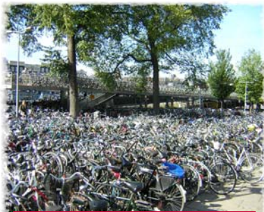
AMSTERDAM – city of bicycles

This is a very interesting time to tour Europe as an American. I certainly got an earful about our foreign policies from local people