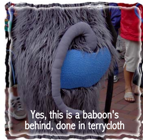
Yes, this is a baboon's behind, done in terrycloth