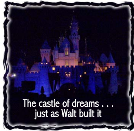
The castle of dreams . . . just as Walt built it