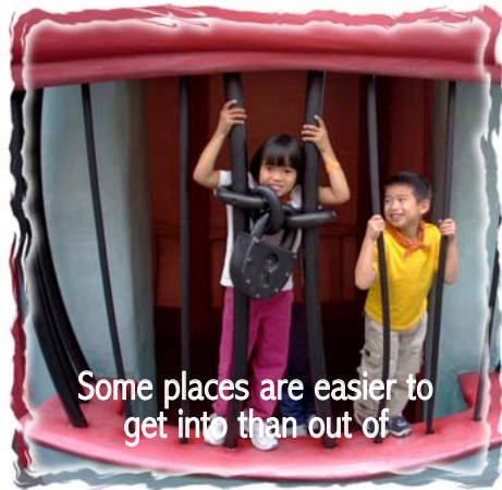
Some places are easier to get into than out of