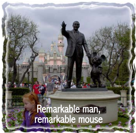
Remarkable man, remarkable mouse