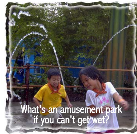
What's an amusement park if you can't get wet?